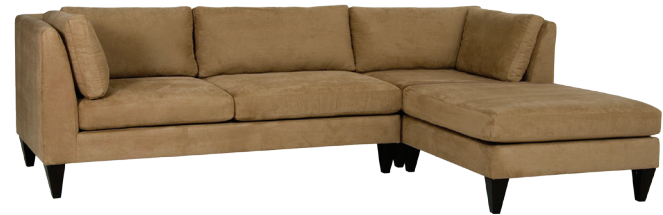
LAF One Arm Loveseat, Corner & Ottoman