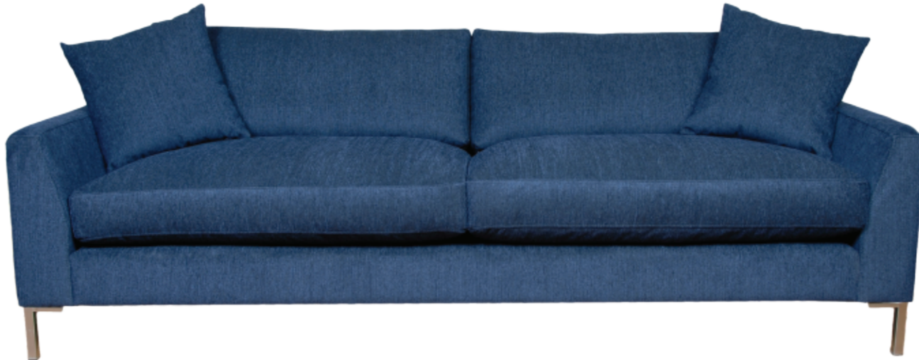
Body Fabric: Malcolm Marine Toss Pillow Fabric: Malcolm Marine