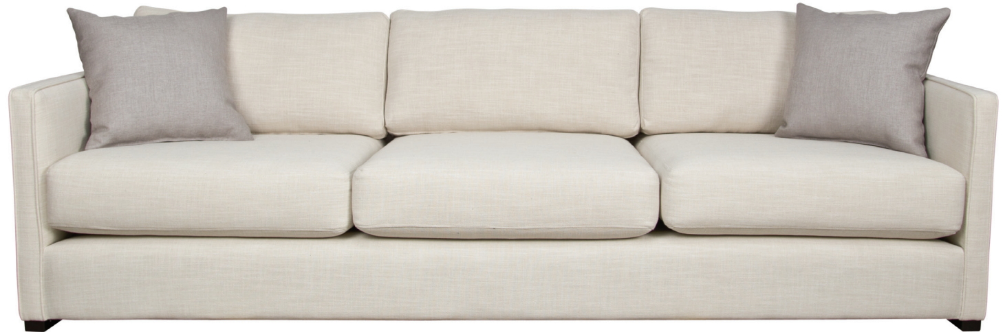
Body Fabric: Dewdney Cream Toss Pillow Fabric: Polo Grey