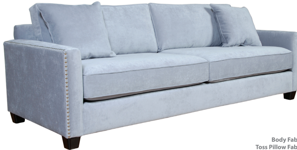
Body Fabric: Posh Grey Toss Pillow Fabric: Posh Grey