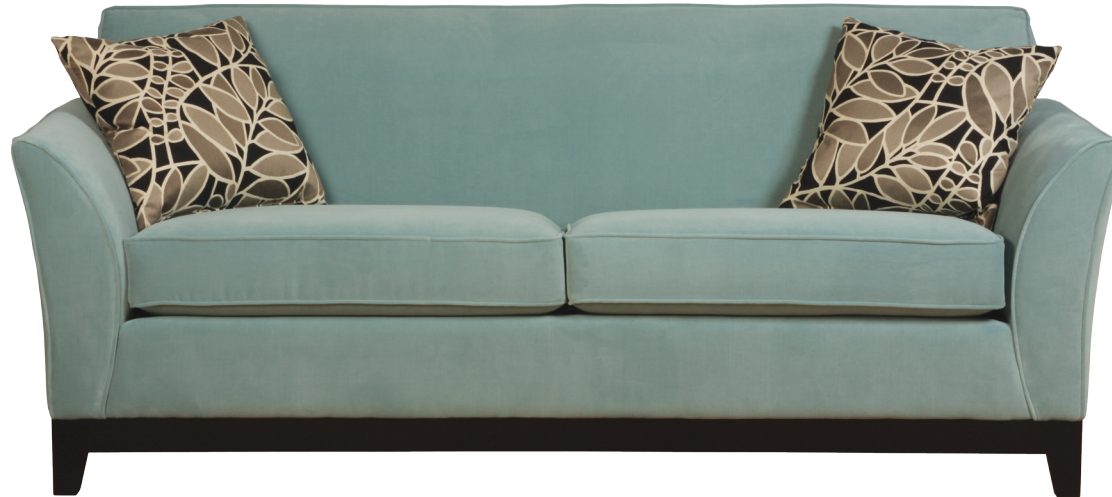
Body Fabric: Othello Duck Egg Toss Pillow Fabric: Olympus Metal